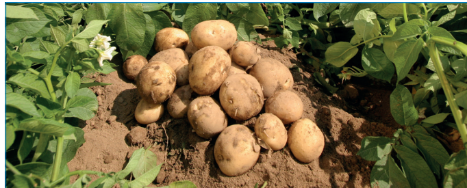
CROP: POTATO, VARIETY: NICOLA