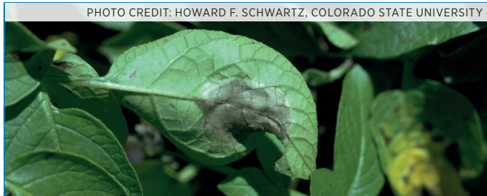
DISEASE: POTATO LATE BLIGHT