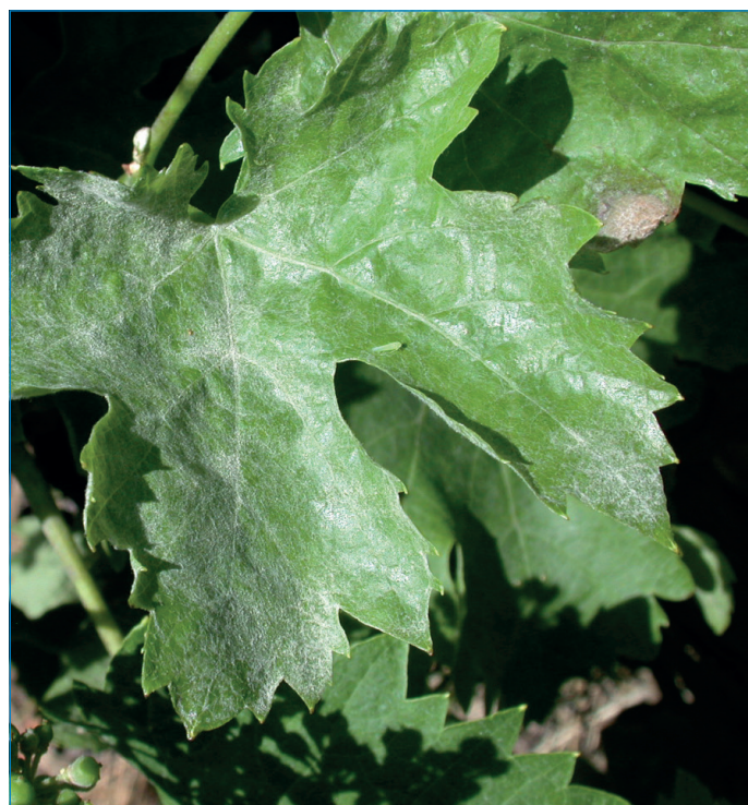
TARGET: POWDERY MILDEW

Treatments were applied with handgun sprayers delivering 935 litres per hectare pre-bloom, increasing to 1870 litres per hectare in the late part of the season.