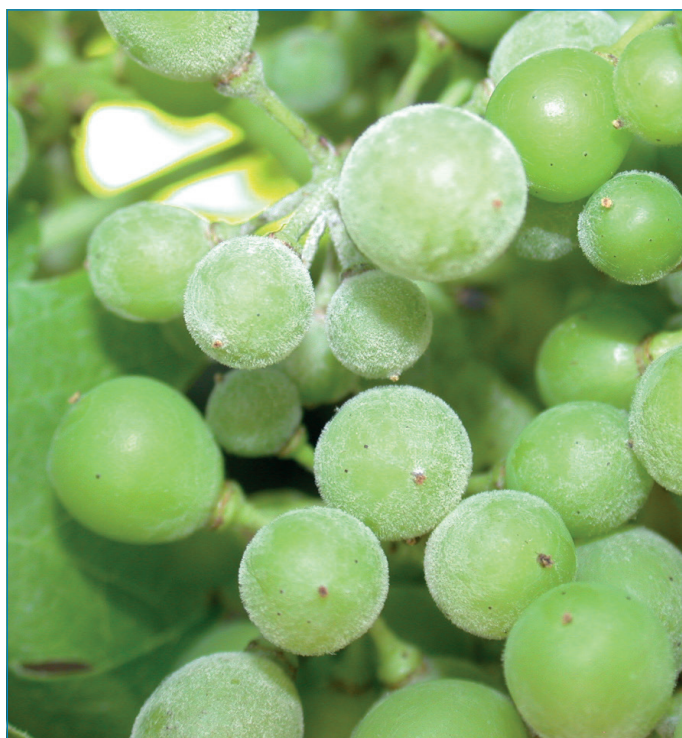
TARGET: POWDERY MILDEW

Treatments were applied with handgun sprayers delivering 935 litres per hectare pre-bloom, increasing to 1870 litres per hectare in the late part of the season.