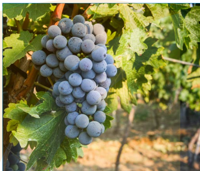
CROP: GRAPE, CV. CABERNET SAUVIGNON